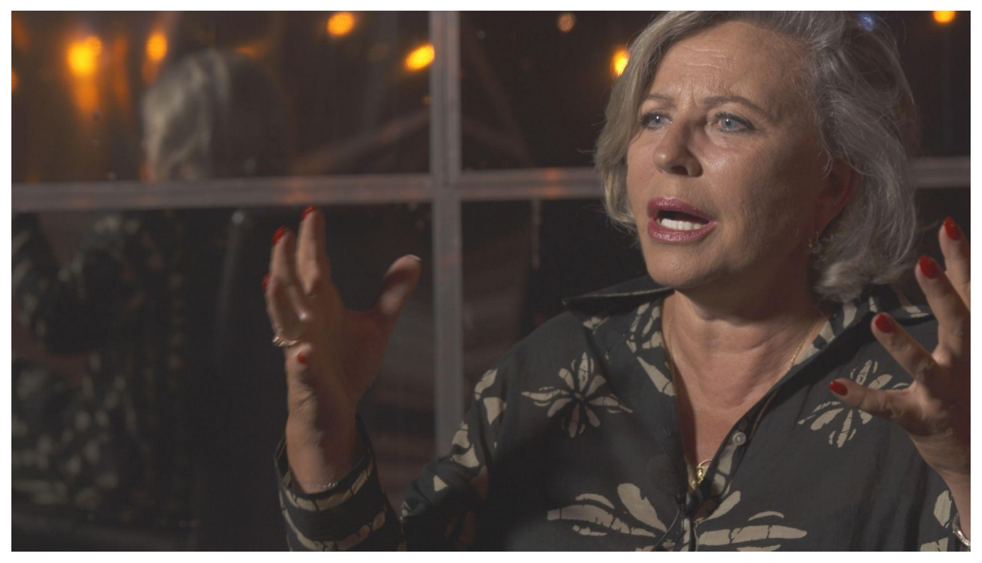
The actress Krystyna Janda