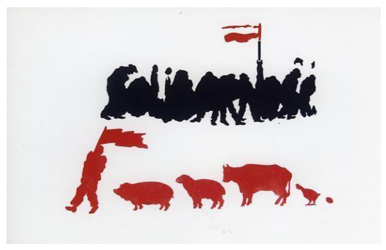
Graphic by Leszek Sobocki, 1982