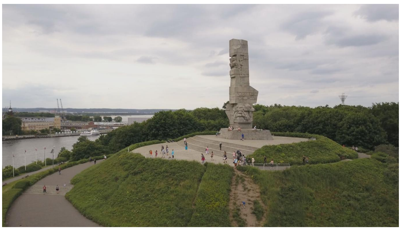
Weterplatte, Gdansk: here started and finished the WWII