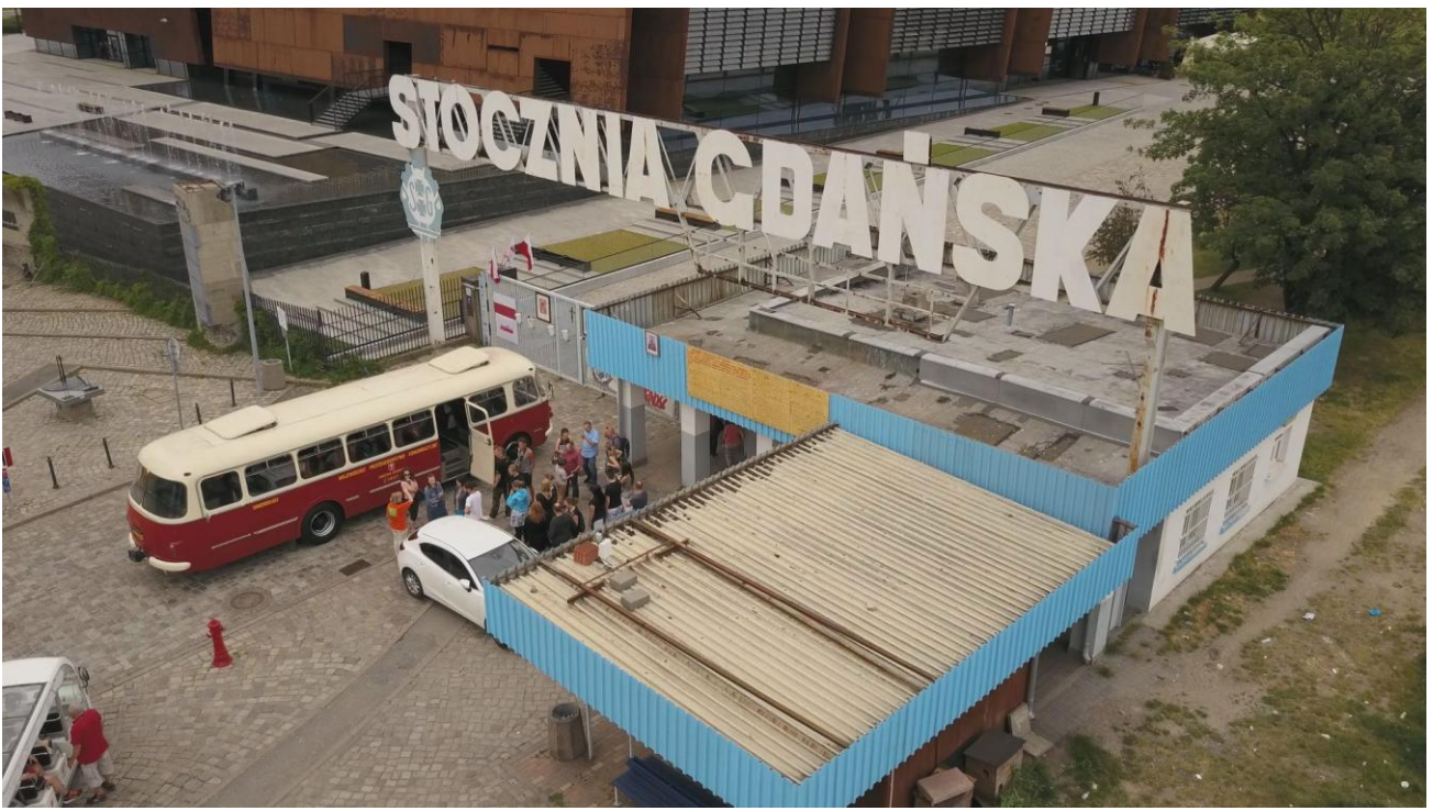
Entry to the shipyards, immortalized in Wajda films. An artistic performans strarts where Solidarność was born.