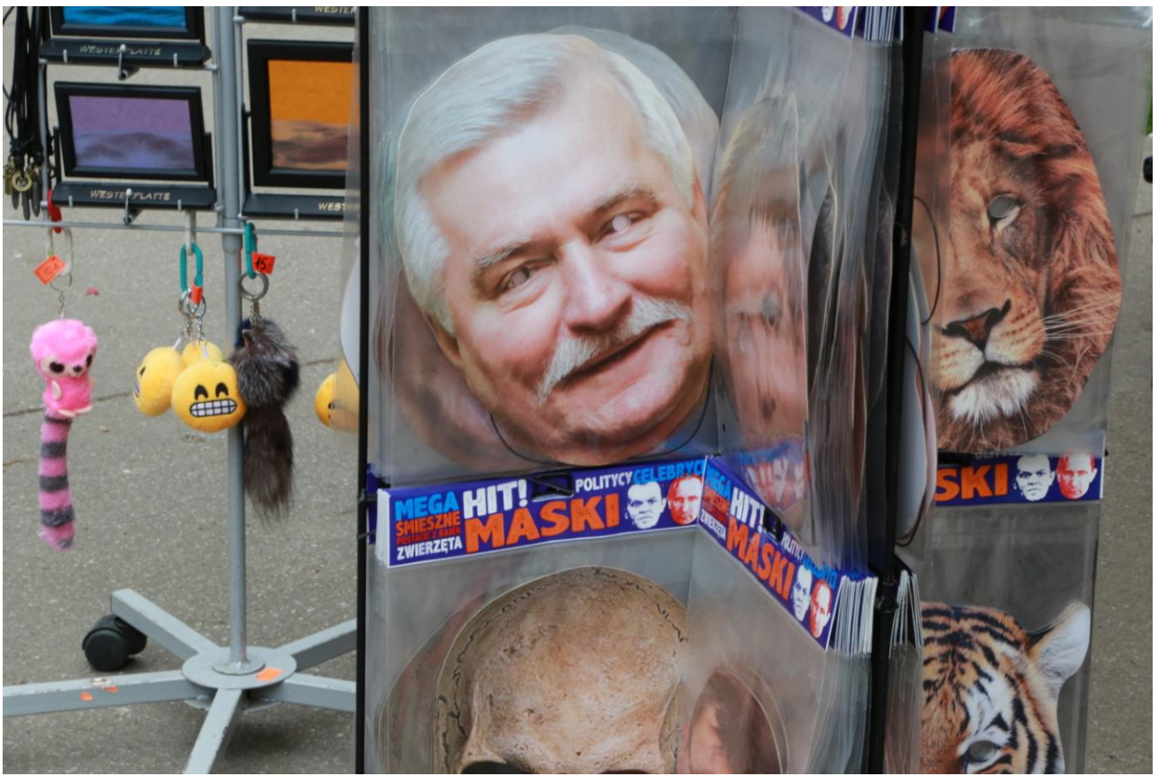
The big story has become a tourist souvenir, the mask of Lech Wałęsa