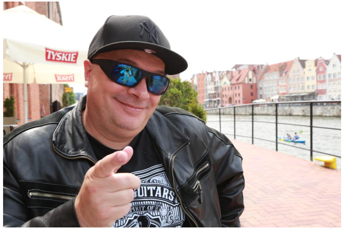
Krzysztof Skiba, the founder of the music Group "Big Cyc" and animator of the "Orange Alternative" in Łodz