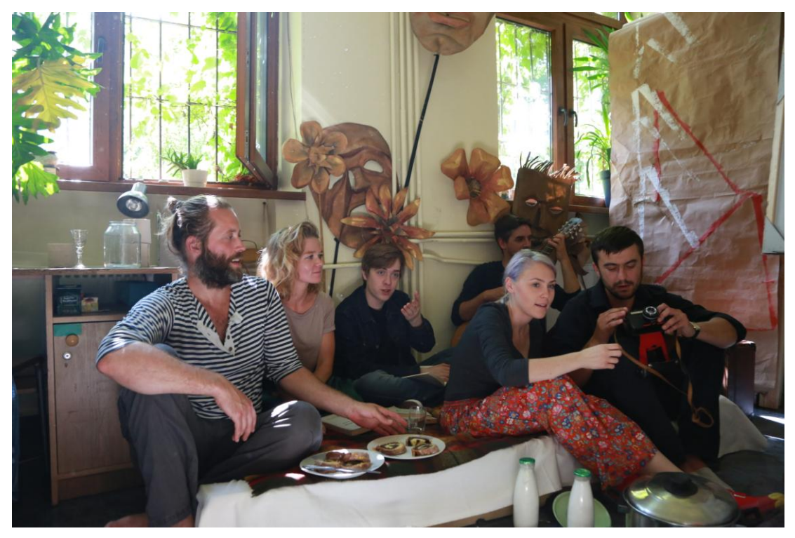
Students in Ulica Pomorska 2